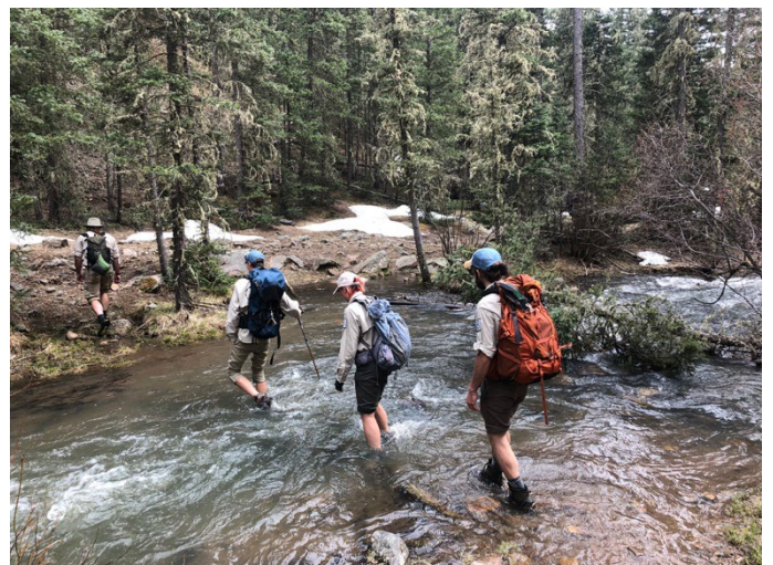
Member support allows New Mexico Wild Wilderness Rangers to monitor public lands and waters.

On the other side of this Advisory, we provide more background on two of the key water policy needs being discussed in this year's budget.